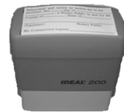
F. SELF-INKING JURAT STAMP

G. NOTARY RECORD BOOK Each time you notarize a document Alabama law requires certain information to be recorded in a record book. Our book is designed specifically to conform to the law and includes complete instructions on how to use it.