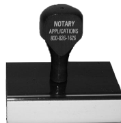
E. JURAT STAMP

D. IMPRESSION INKER This inker quickly marks the raised portion of the impression with black ink. Shading with a pencil is also effective but very time consuming.